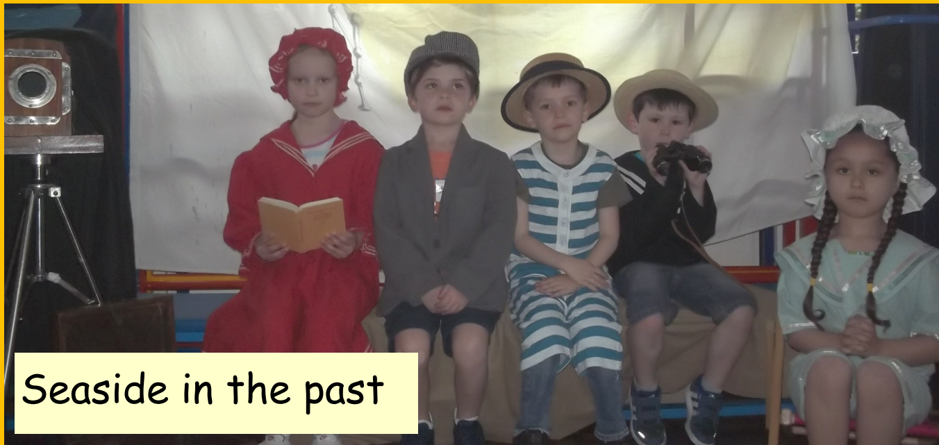
Seaside in the past