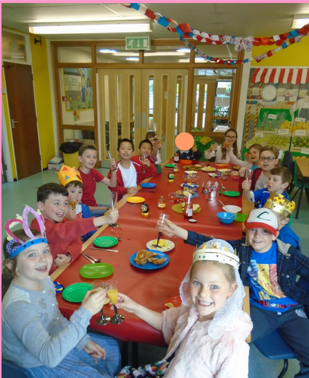
The Breakfast Club children had a royal start to the day!