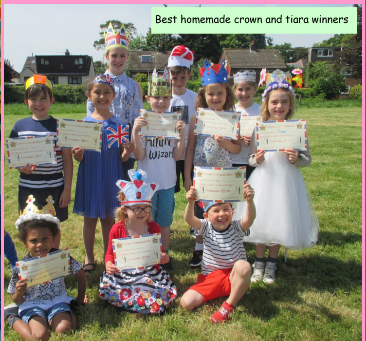
Best homemade crown and tiara winners